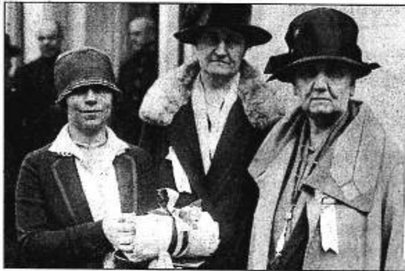
Members of the Women's International League for Peace and Freedom come to Washington to call for world disarmament.

T he mothers' groups formed just in the last century to speak out on issues of war, peace and justice are as diverse as they are plentiful. Some have organized around the motherhood identity to try to avert conflict or to protest government oppression. Early in the 20th century, the Women's International League for Peace and Freedom formed to protest World War I. Here in the United States, the Vietnam War gave rise to the anti-draft group Another Mother for Peace, and the Cold War to the anti-nuclear Women Strike for Peace. Elsewhere, the CoMadres in El Salvador denounced government human rights abuses during the civil war of 1981-1992. The Mothers of the Plaza de Mayo in Argentina protested the disappearances of their children under the nation's military dictatorship that ran the country from 1976 to 1983.