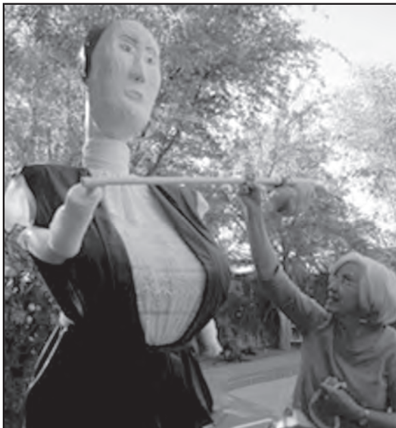
A Tucson WILPFer puts the finishing touches on their Jane Addams puppet. What could we do with a Cape Cod Jane Addams puppet?

At the May meeting, we made the decision to use this SMART process and then proceeded to talk about what our campaigns might be about. It became clear that we needed standards to use in choosing a campaign and a committee proposed the following at our June meeting.